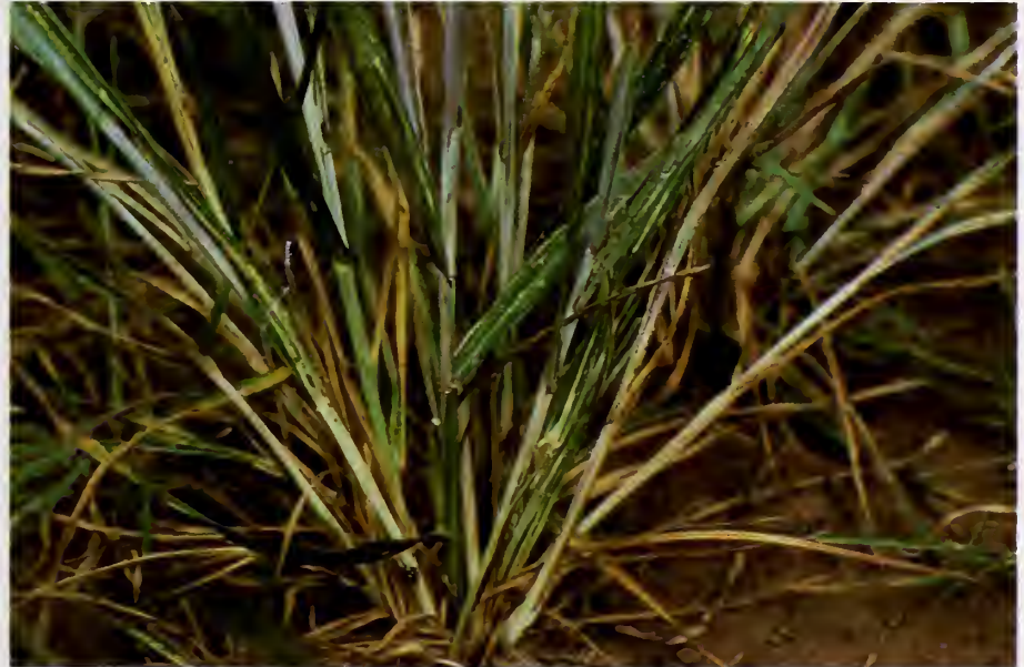
A wheat plant showing Russian wheat aphid damage.

Since the Russian wheat aphid came to North America, grain farmers